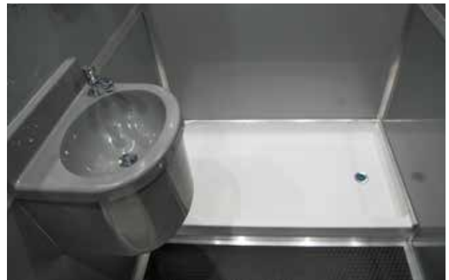
Standard Shower Room