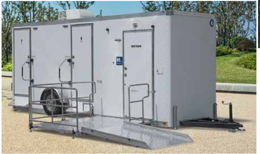
Trailers may feature optional equipment available at an additional charge.

The UltraLav® ADA series units are ADA compliant restroom trailers. These units meet or exceed the permanent structure criteria as specified by the American Disabilities Act. Everything needed for set-up is totally self-contained. The amazing engineering feat is accomplished by our exclusive and proprietary “one-touch” hydraulic trailer lowering system, which lowers the entire trailer smoothly and quietly.